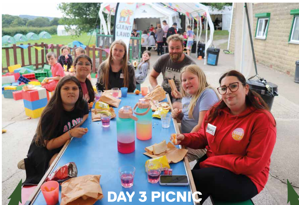
DAY 3 PICNIC

Hot chocolate and biscuits. Served in the hut by your good selves except on the last night when they will have pop and snacks at the disco. At the end of supper as the full time volunteers put the children to bed please make sure all the cups are washed and ready for breakfast and set up the self-service table for breakfast too.